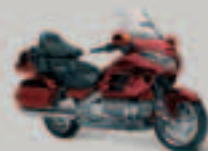
Cabernet Red Metallic