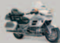
Billet Silver Metallic