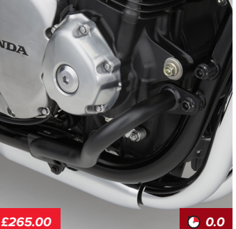
ENGINE GUARD MATT BALLISTIC BLACK METALLIC 08P70-MGC-JD0

A chrome, tubular engine guard that protects the surface of the engine cover.