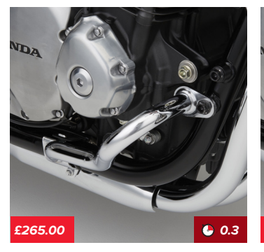
ENGINE GUARD CHROME