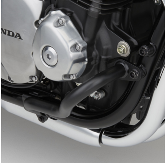
ENGINE GUARD - BLACK

A chrome, tubular engine guard that protects the surface of the engine cover.