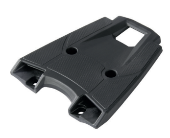
TOP BOX BASE

A colour-matched 45L Top Box Kit offering the capacity to store two full-face helmets and more. Features a locking, quick-detach mounting system. Complete with all compontent required to fit.