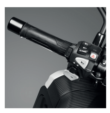
HEATED GRIP KIT (360°) (ADVENTURE PACK) AVERTO ALARM SYSTEM

Extremely slim Heated Grip Kit, with integrated control for maximum rider-comfort. Features 3-step variable heating levels, with smart heat allocation that focuses on the area of the hands that are most sensitive to the cold.