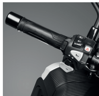
HEATED GRIP KIT (180°) (TOURING PACK)

Attaches the Topbox to the rear carrier. Injection-moulded resin top box base. Image for illustrative purposes only.