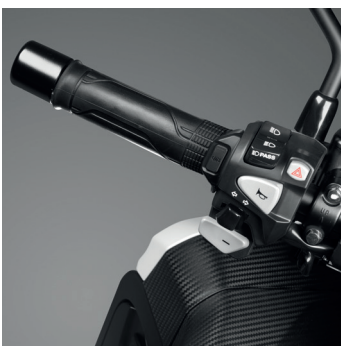
HEATED GRIP KIT (180°) (COMFORT PACK)

Attaches the Topbox to the rear carrier. Injection-moulded resin top box base. Image for illustrative purposes only.