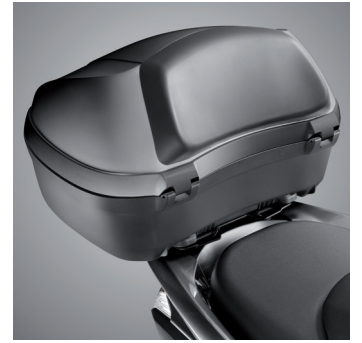
45L TOP BOX KIT

Specially engineered for this model, this Polycarbonate High Windscreen offers more shelter from the elements without hindering visibility.