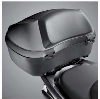
45L TOP BOX KIT

Specially engineered for this model, this Polycarbonate High Windscreen offers more shelter from the elements without hindering visibility.